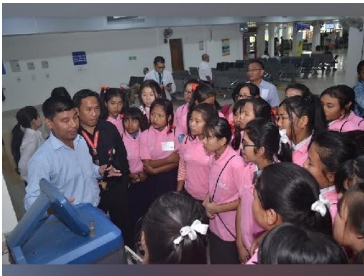
Girls in Aviation Day Imphal