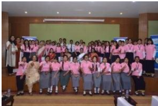
Girls in Aviation Day celebration Imphal June 13 2018

Women in Aviation International, India Chapter and Lockheed Martin Corporation in association Airport Authority of India (AAI) today celebrated Girls in Aviation Day at Imphal Airport. With the vision to encourage girls to take up STEM subjects and explore career opportunities in related industries, the initiative is aimed at showcasing opportunities in the aviation and aerospace sectors. Lockheed Martin is investing in developing the next generation of future scientists and engineers in India. This initiative also aligns with the Government of India's Skills India initiative.